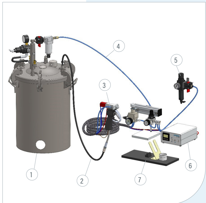
Representative SG-200 Spray Dispensing System (T21280 with 10-Gallon Pressure Pot Shown Below)