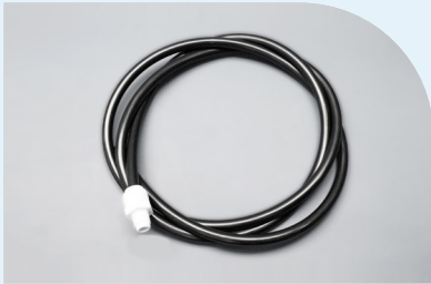
Fluid Line Kit, 3/8" OD Polyethylene