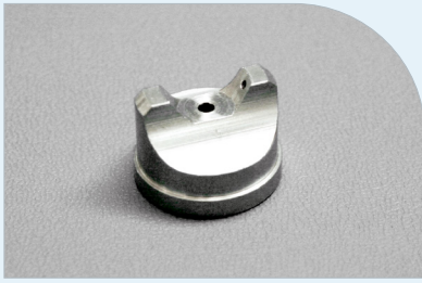
Flat Spray Air Cap