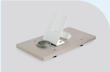
Stand with Drip Cup