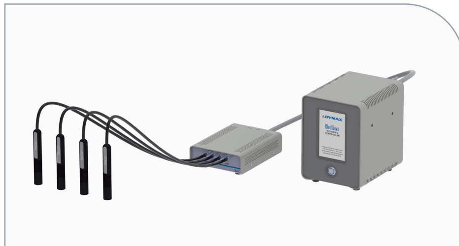
The MX-4E Expansion Module Allows Users to Operate Up to 16 LED Heads with One Controller

** The appropriate power cord will be added for European customers.