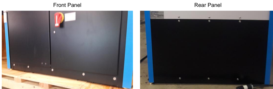
Figure 1. Front and Rear Panels - Remove for Forklift Access