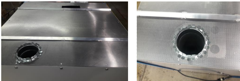
Figure 2. Blower Exhaust Vent Connection

Insufficient ventilation could cause a blower fault error on the HMI display and cause overheating.