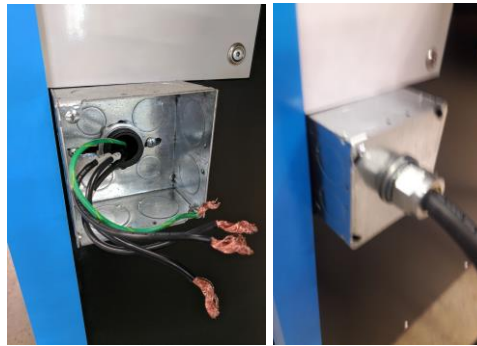
Figure 4. Two Wiring Options